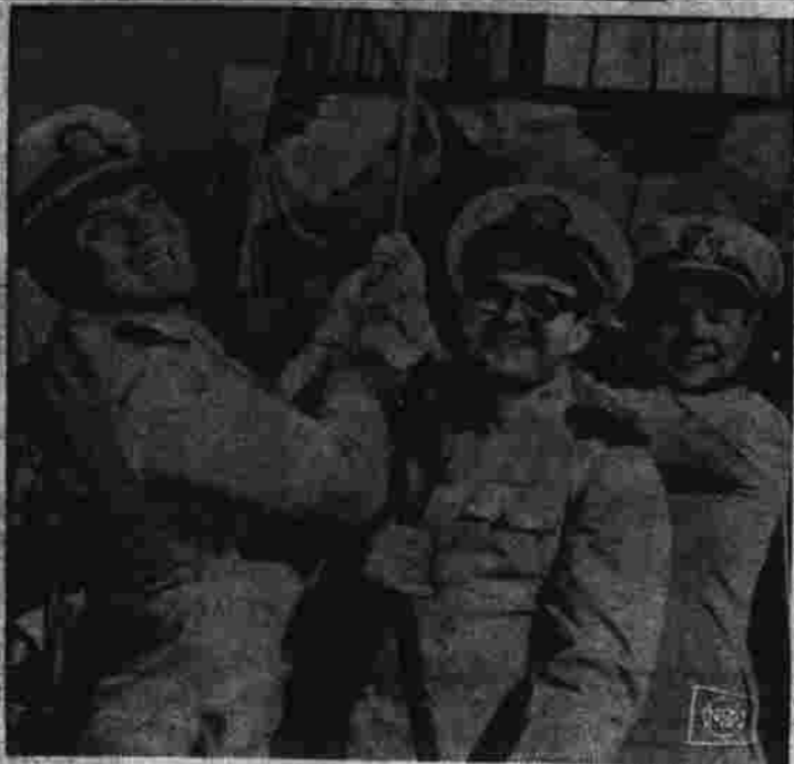
The Navy men, Borgnine, Flynn and Conway

By JOAN CROSBY NEW YORK—(NEA)—Three of the McHale's Navy crew, Joe Flynn, Tim Conway and Carl Ballantine, were found a bit off their normal day run. They were having dinner at the picturesque, sedate Forest Hills Inn, in suburban New York City, between personal appearances at several local movie houses to promote the saturation booking of their movie, also called "McHale's Navy." (Saturation booking doesn't mean the picture or cast is all wet. It means the film opens simultaneously in several theaters.) "We're passion's toy," Flynn intoned. "We don't know where we are going from moment to moment. Our fate is in the hands of others." "We do a five-minute song and dance act you wouldn't believe," said Conway. "You might not hear it either. There's a lot of boogie and hissing." "We have been interviewed by 600 people with tape recorders," Flynn growled. "They crawl out of the woodwork. I think half of them play the tapes only for their friends and neighbors." First-Fighting Feud It was suggested that door-to-door taped interviews, privately played for a small fee, might be a good small business to open. "We're thinking of doing the show that way, too," smiled Conway. The talk inevitably turned to the well-publicized, fist-fighting feud (now patched-up) Flynn had with the show's star,